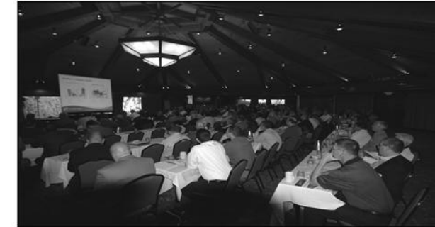
The welcomed audience