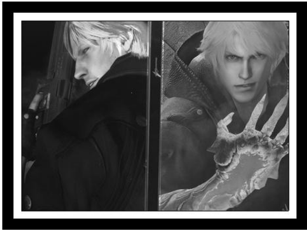
2008 Grand Award Devil May Cry Ohio Art Bryan, Ohio

The International Metal Decorators Association, with sponsorship from INX International Ink, is proud to announce the "Call for Entries" for 2009's competition. The competition consists of 8 categories: Two Piece, Food Containers, Aerosol Cans, Closures, Signs & Displays, General Line Cans, Specialty Cans, and Miscellaneous Products.