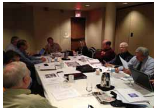
Your IMDA Board of Directors at Work October, 2012