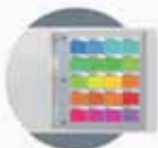
Metal Switch Catalog