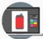
Digital Color Library

Learn more by visiting inxcolorperfection.com